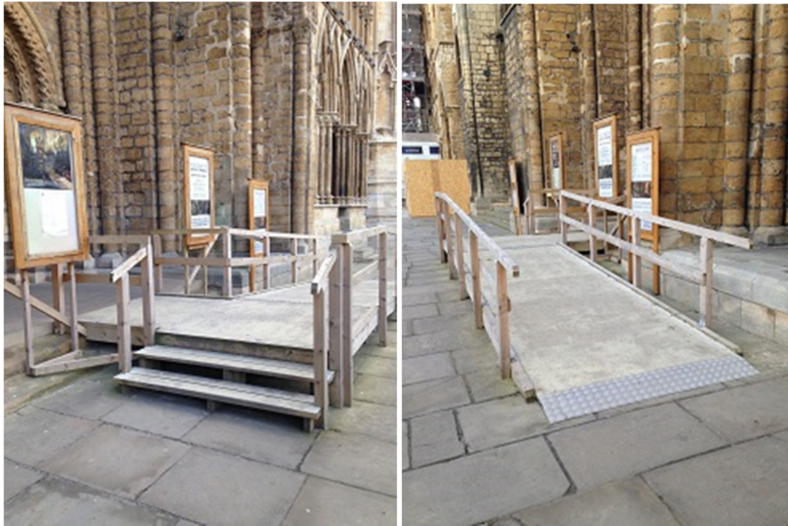
Above: The steps and ramp at the cathedral's main entrance.