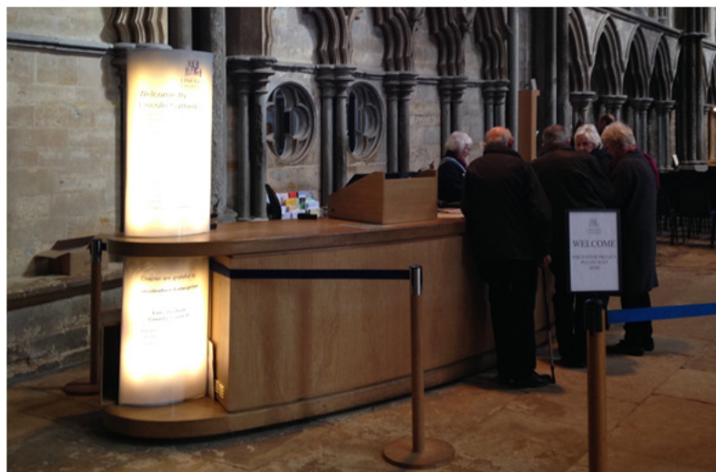
Above: The ticketing and reception area inside the cathedral.