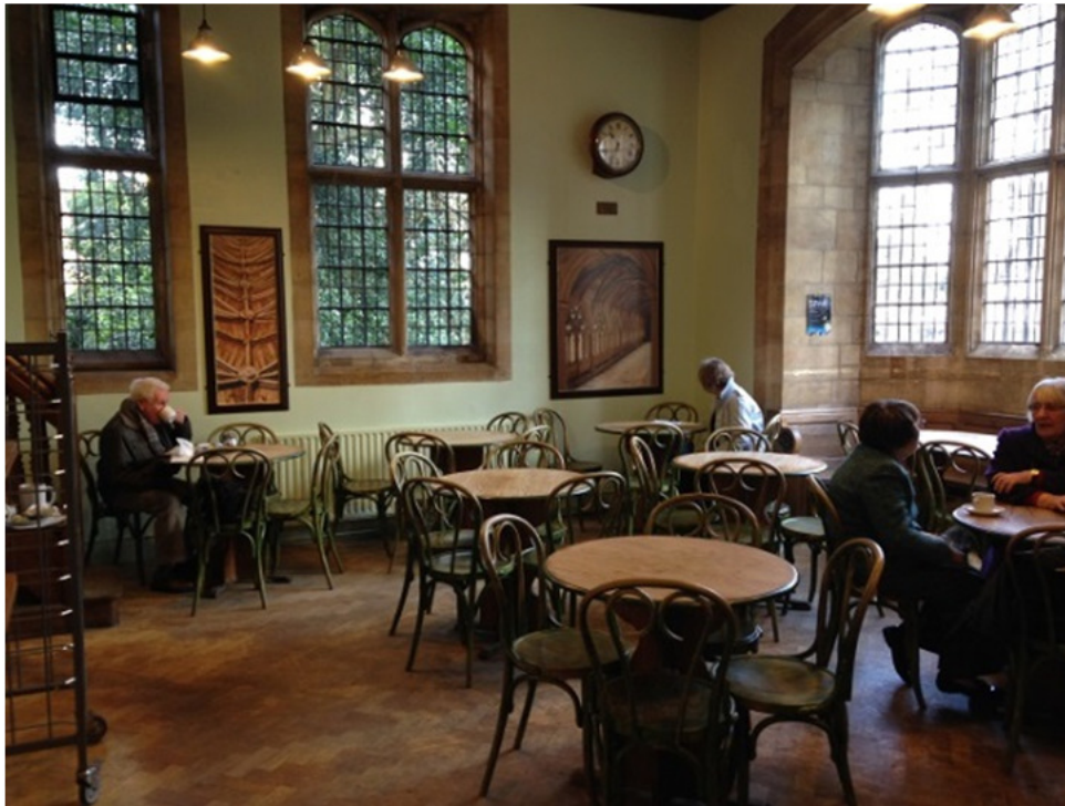
Above: The seating area in the Refectory Café.