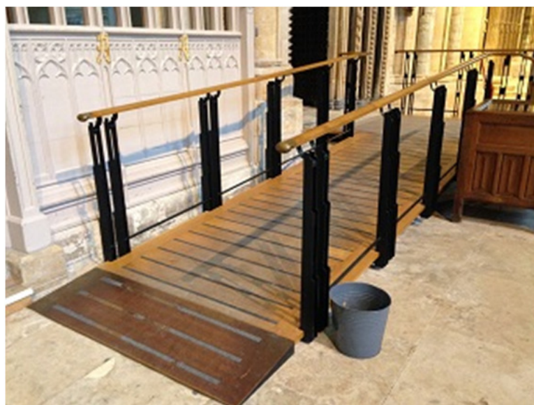
Above: The steps and ramps between levels inside the nave.