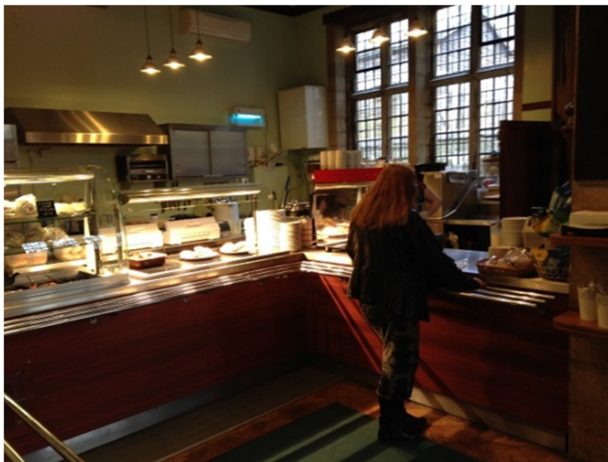
Above: The service counter in the café.