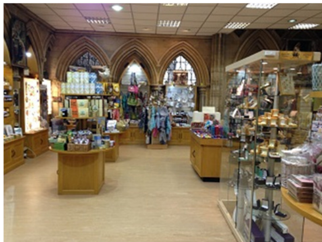
Below: the floor space in the shop.