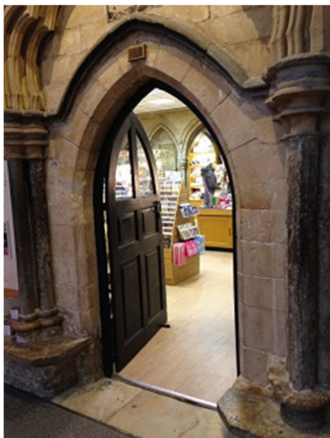
Left: The entrance into the shop.