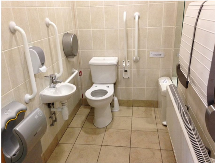
Above and below: the accessible toilets located off the cloister.