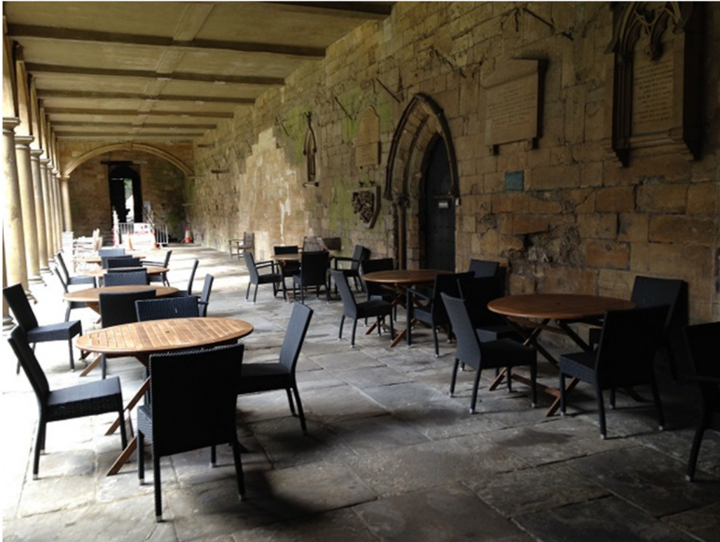
Above: Café seating in the cloister.