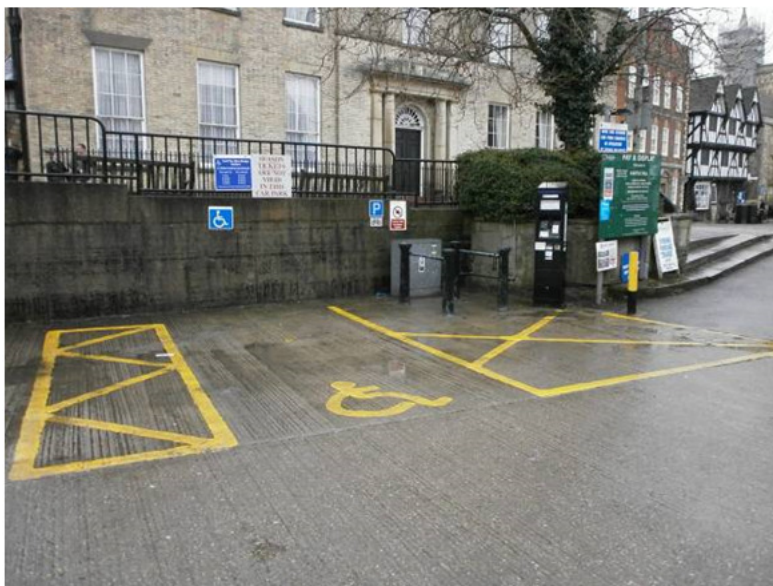
Above: The accessible parking bay.