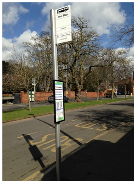
Left: Bus stop by the Lincoln Hotel (stop for the cathedral). Right: Bus stop on Nettleham Road (stop for the Bus Station)