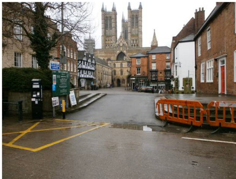
Above: The Castle Hill Car park is the closest to the cathedral.