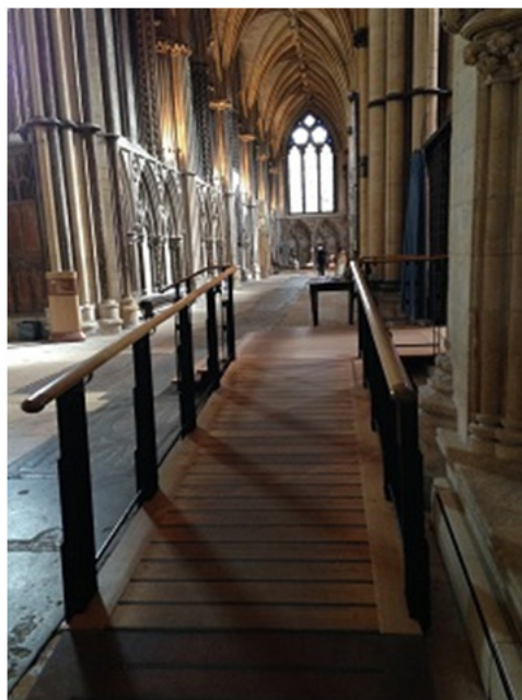
Above: The ramp into St Hugh's Choir.