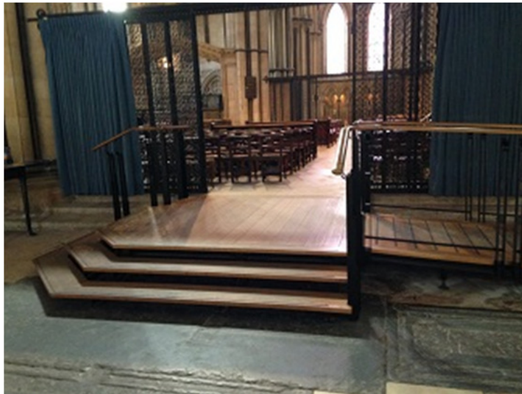
Above: The steps into St Hugh's Choir.