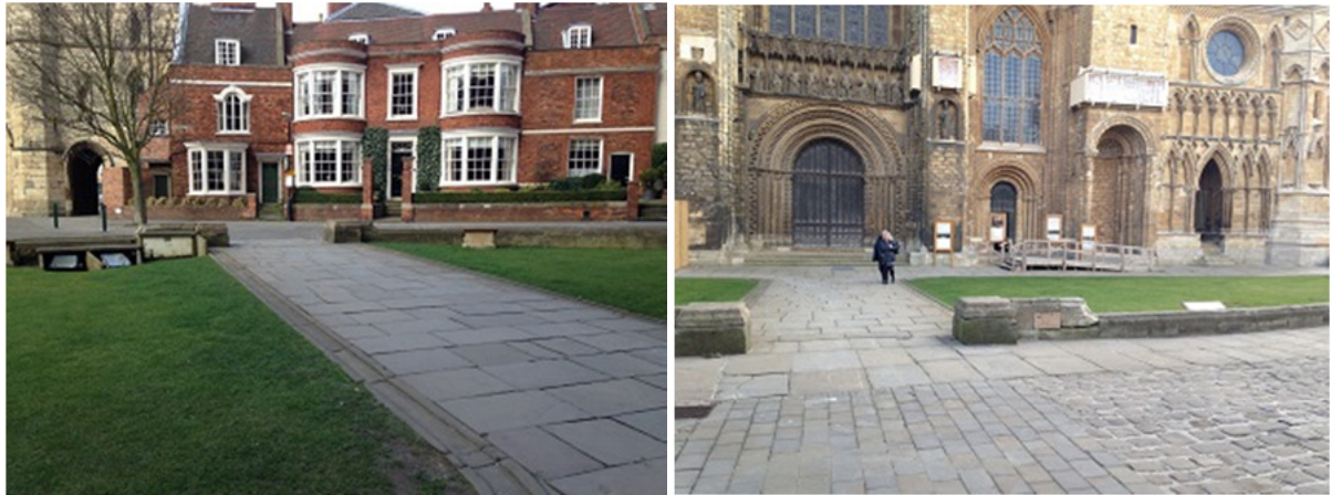
Above: The drop off point in Minster Yard is a short walk to the Cathedral.