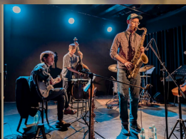
LINCOLN JAZZ FESTIVAL